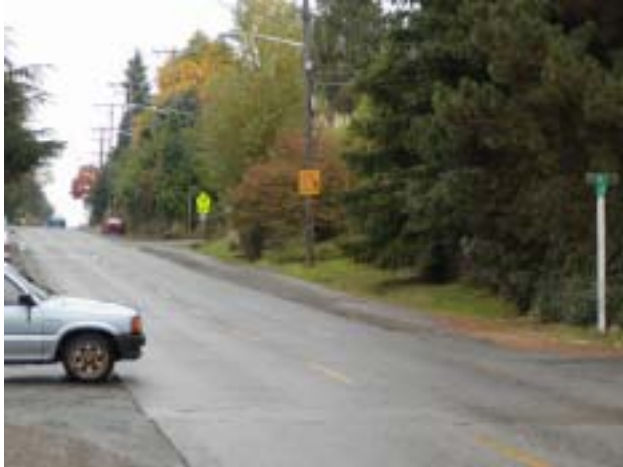
15th Ave NE