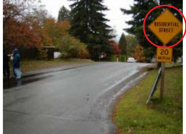
NE 98th St at 15th NE