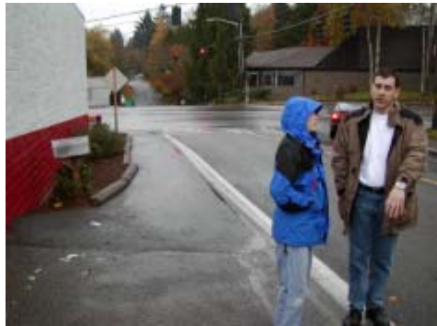
NE 98th & Lake City Way

This is a significant missing link for children who would like to walk to school, as it leads from the busy intersection with pedestrian controls past businesses that border on the beginning of the residential portion of NE 98th Street.