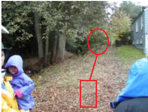
20th Ave NE @ 97th Street (trail)