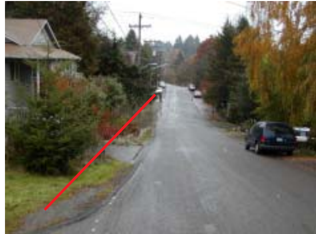
20th Ave NE