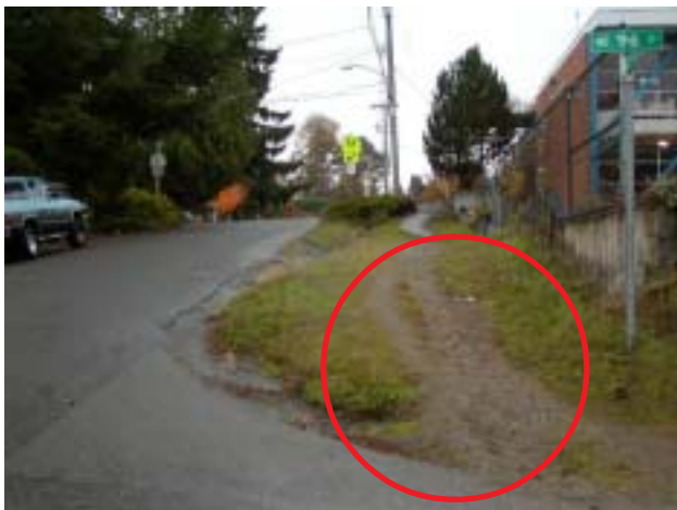
20th Ave NE at NE 96th St