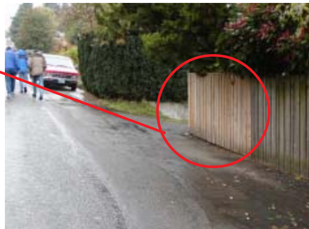
NE 98th St west of 20th NE

Damage, injury and death , correlate exponentially with speed. A portion of this fence was rebuilt after a car ended up going off the street. Taming the traffic is not just about preferences or ideals, it is a significant solution for a problem with real consequences.