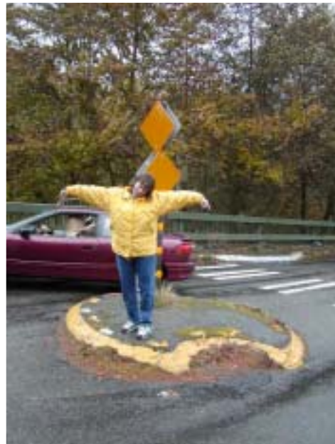
20th Ave NE & NE 98th St