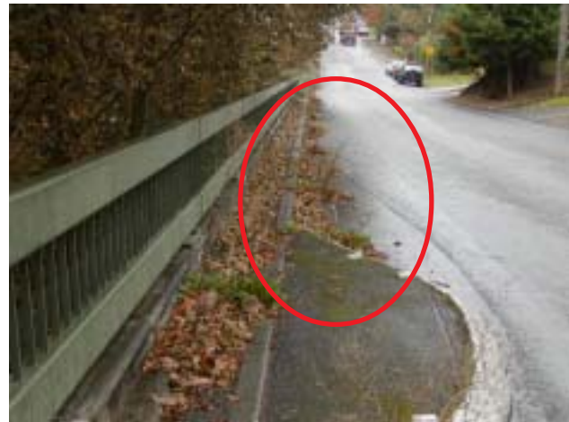
NE 98th east of 20th NE

This would be a good project for the neighborhood matching fund or the new sidewalk program.