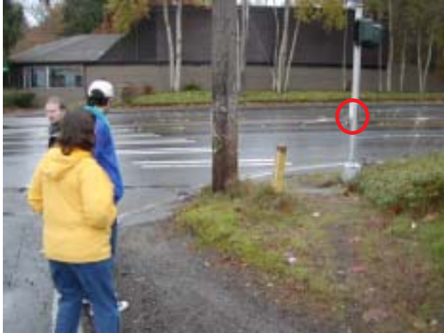
NE 98th & Lake City Way