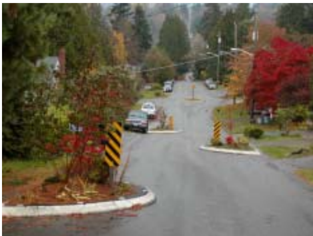
Western chicane on NE 98th Street.